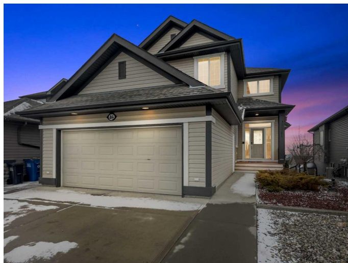
48 Sunset Ct, Cochrane, AB

Step inside to find a sun-filled interior, with large windows framing the breathtaking mountain vistas. Hardwood floors lead you from the welcoming foyer into the expansive living space, where the kitchen, dining, and living room flow seamlessly together. The gourmet kitchen features beautiful cabinetry, a large wrap around eat-up island that easily sits 8, granite countertops, stainless steel appliances, ample pantry space—perfect for both cooking and entertaining. Off the large kitchen dining, an patio space ideal for hosting barbecues, reading a book or simply enjoying the stunning mountain views, sunsets and nature at large. The cozy living room includes a gas fireplace, setting the tone for a warm