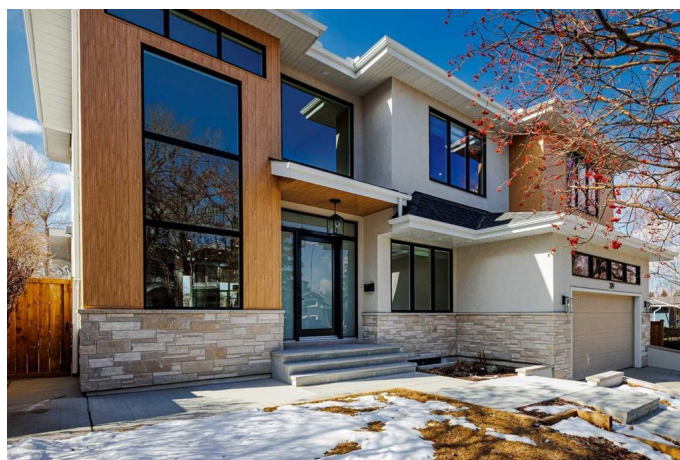
319 42 St SW, Calgary, AB