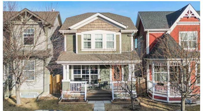
24 AUBURN BAY CRESCENT SE REC-A MEASUREMENT STANDARD - CALGARY, AB MAIN LEVEL (AG) - 680.00 Sq Ft / 63.17 m 2 UPPER LEVEL (AG) - 680.65 Sq Ft / 63.23 m 2 TOTAL ABOVE GRADE RMS SIZE - 1,360.65 Sq Ft / 126.40 m 2

Jewel of a Deal!!! Convenient Location - Steps away from the Lake, ponds, Ice rink, parks, pathways, schools, shopping, transit, South Pointe Hospital, Seton YMCA, and the new exits. A wonderful URBAN STYLE HOME with many upgraded features & meticulously crafted by the original owner - Truly a family home. Over 1360 SF of living space offering 3 bedrooms, 2.5 baths & a big backyard... Check out the floor plan! This OPEN design features a spectacular CHEF'S kitchen looking over the dining area and great room. Upgraded Fit & Finish features include: 3-way gas fireplace, hardwood floors throughout the main floor living areas, light & plumbing fixtures, baseboard, doors and casings... and so much more! The kitchen is masterfully designed for efficiency and entertaining (maple raised panel doors & trims), granite counter tops, upgraded stainless steel appliances (gas stove) & over the range microwave, pantry, computer work station, tiled backsplash, dramatic central island with pendants, raised eating bar for three & under mount stainless steel sink. Upstairs includes an oversized primary bedroom with a full ensuite (Big soaker tub with shower head) and a separate supersized walk-in closet open to the below staircase with railing and two good-sized spare bedrooms. Other impressive features include an Unspoiled basement, a big backyard with a wood deck, a fully fenced backyard, rich front curb appeal with a full-width verandah, and a covered entry. May 22 possession date! Call